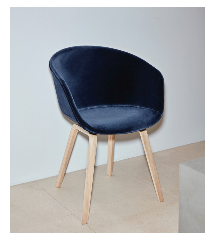
About A Chair AAC23 Lola navy / Soaped oak base