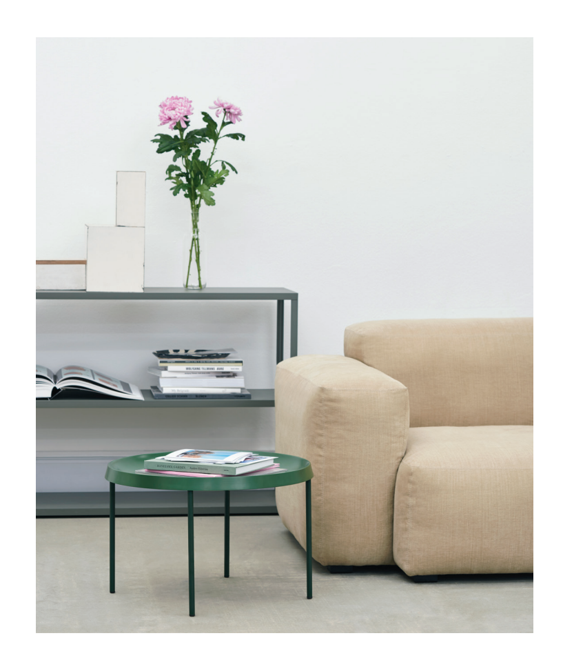
New Order, Tulou Coffee Table & Mags Soft Low / Linara 216