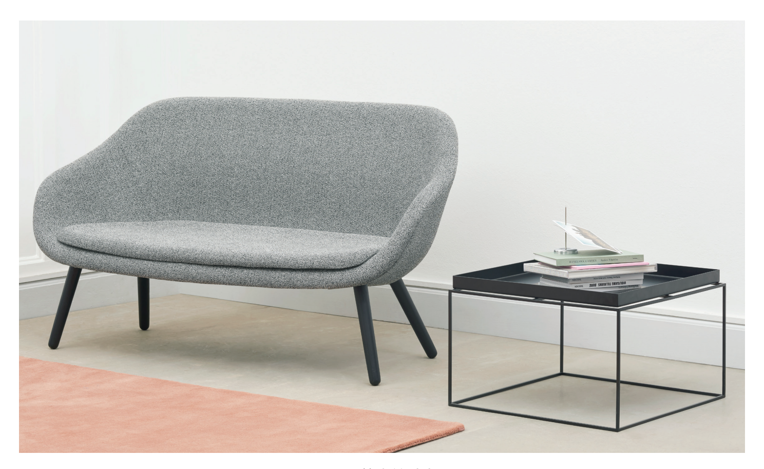
Tray Table & AAL Sofa Olavi 03 / Black stained solid oak base