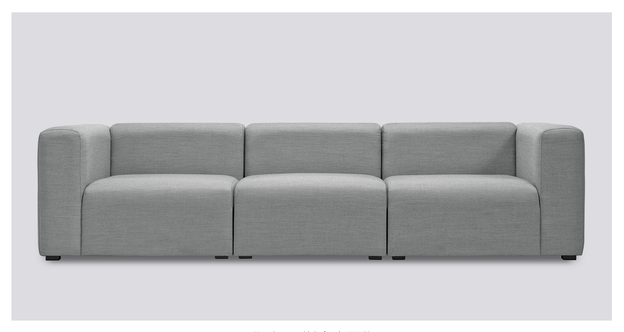
Mags 3 seater with Surface by HAY 120