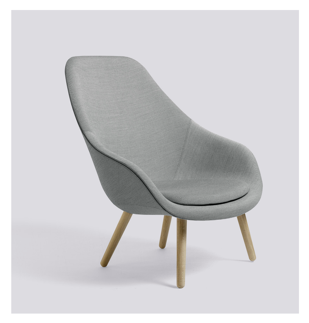
AAL92 with Surface by HAY 120 and soaped oak base