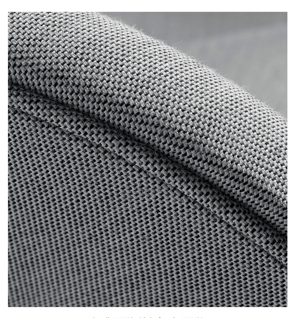
Detail / AAL92 with Surface by HAY 120

The textile was created in a collaboration between HAY and Kvadrat.